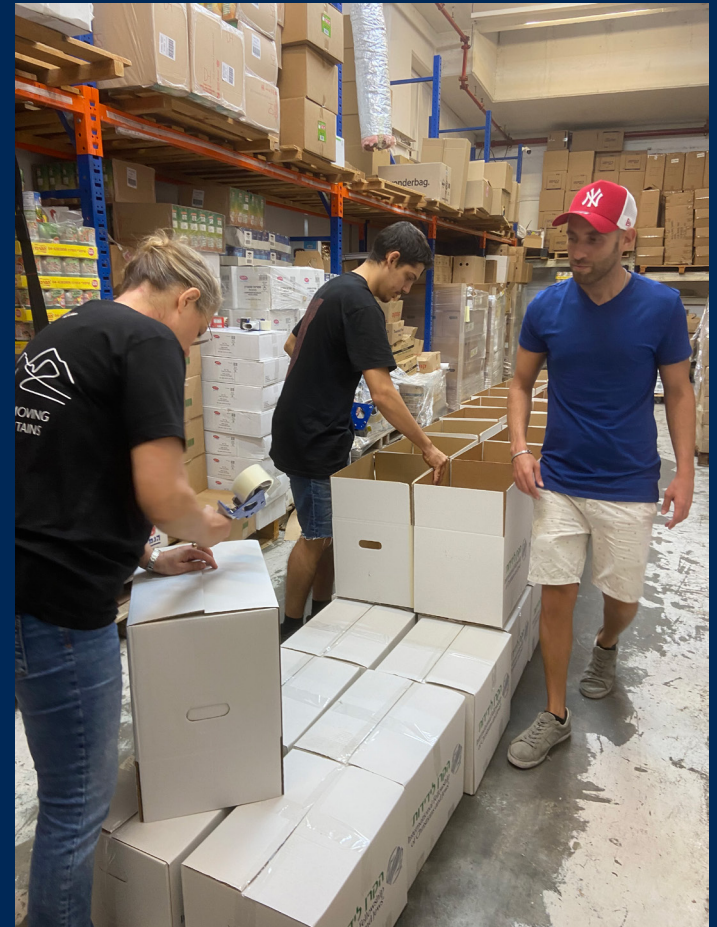
Akamai volunteers assemble food and care packages.

We prioritize employee safety and well-being, partnering with employees to respond in meaningful ways. In addition to the Akamai Compassion Fund and humanitarian grants, the Foundation offers employee matching gift programs to support employees and double donations to charities of their choosing.